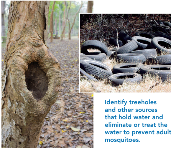
Identify treeholes and other sources that hold water and eliminate or treat the water to prevent adult mosquitoes.

The treehole mosquito life cycle is centered around standing water that accumulates in holes in the trunks and branches of trees, or in artificial containers and tires. A wide variety of trees are commonly used by treehole mosquitoes, with oaks, bay, walnut and eucalyptus being the most common due to the high tannin levels.